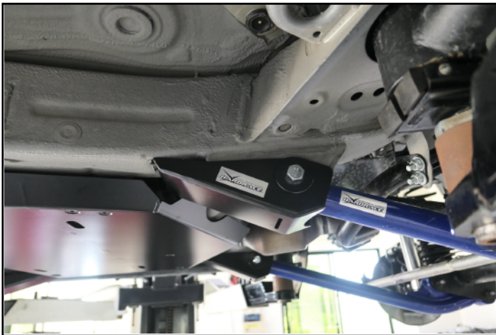
▾ Front control arm schematic diagram. 前端安裝示意圖。