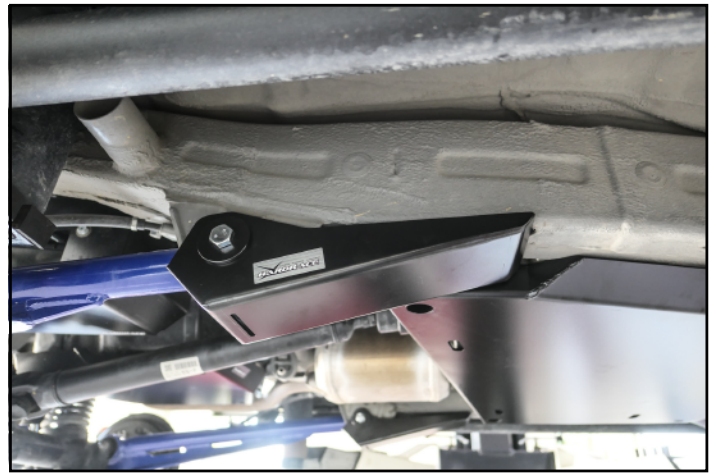
▾ Rear control arm schematic diagram. 後端安裝示意圖。