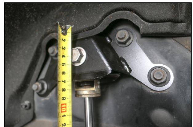
Illustration of installed state 安裝完成示意圖